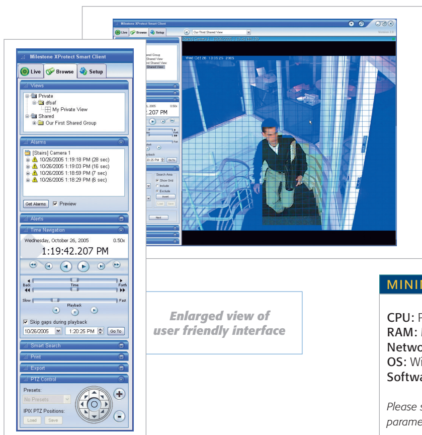
Enlarged view of user friendly interface

Milestone solutions are in operation on 100,000 cameras globally, across a wide spectrum of industries from retail, transportation and production, to finance, health, education, government, the military and police. 10,000 customers attest to the proven track record of the robust XProtect products. Milestone Systems are sold through an authorized channel of 170 professional partners in 55 countries.